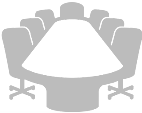
Conference room table