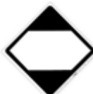
Limited Quantity Ground